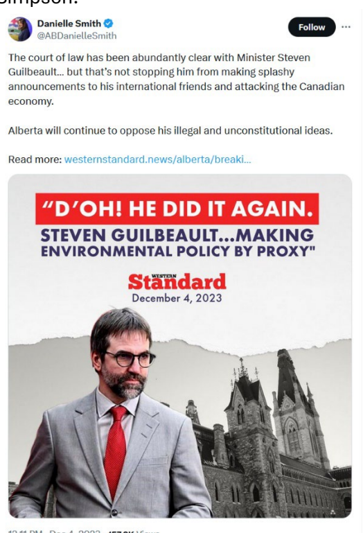
12:11 PM · Dec 4, 2023 · 157.8K Views

<u>https://x.com/ABDanielleSmith/status/1731753105908506650</u>. An unflattering and potentially abusive statement "D'OH!" referring to the inferred low intelligence of fictional Simpson's character Homer Simpson.